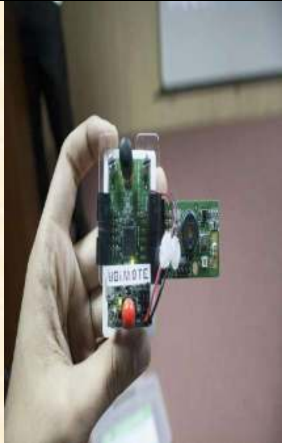
LIGHT SENSOR USED IN IOT (TOP VIEW)