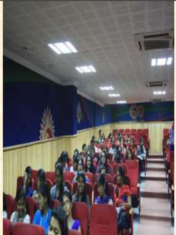
VII SEM STUDENTS PARTICIPATION IN THE WORKSHOP BY C-DAC