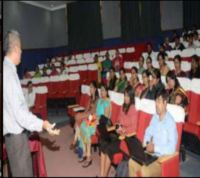
More Glimpses of the National Symposium on Data Science