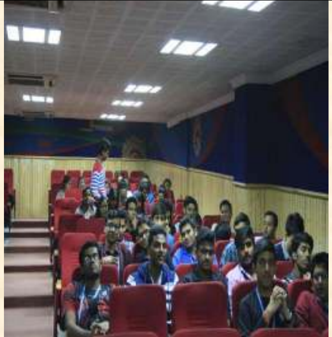
VII SEM STUDENTS PARTICIPATION IN THE EXPERT TALK