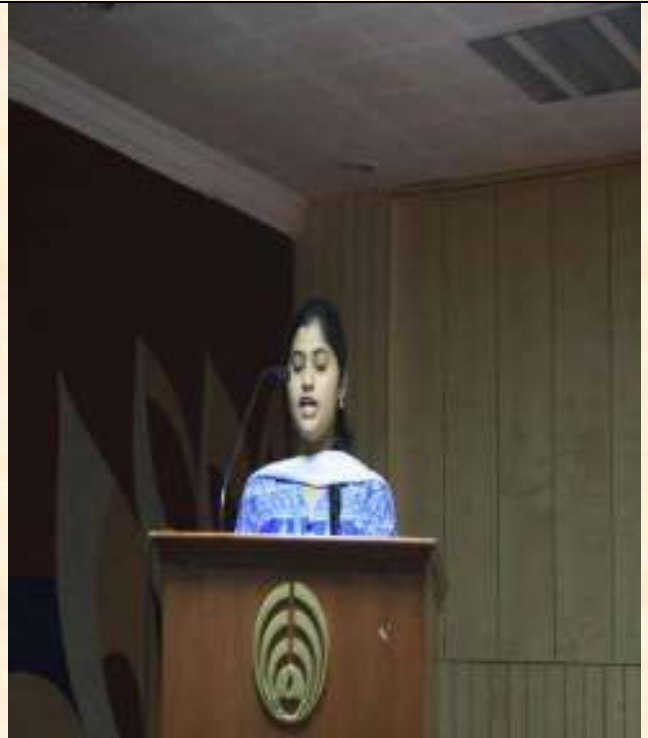
MC BY VII SEM STUDENT