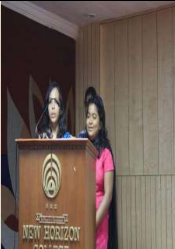
INVOCATION SONG BY VII SEM STUDENTS