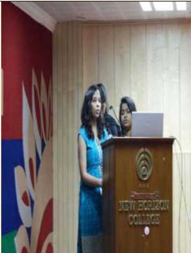
INVOCATION SONG BY VII SEM STUDENTS