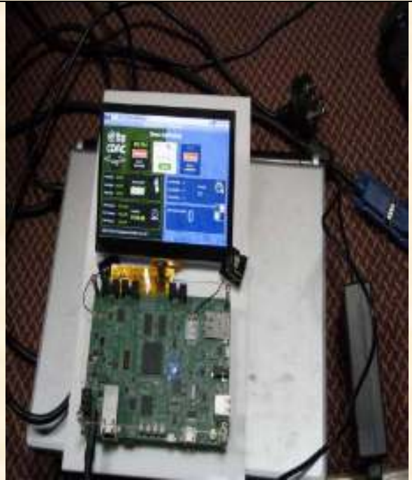
IOT DEVICE INCLUDING MICROCONTROLLER, DISPLAY AND SENSOR BY C-DAC