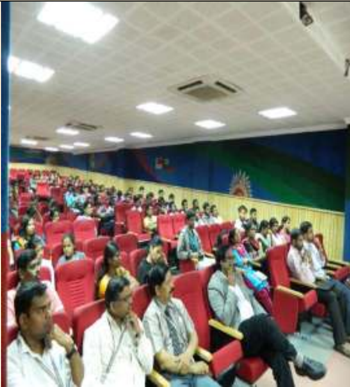
FACULTIES AND VII SEM STUDENTS PARTICIPATION IN THE WORKSHOP BY C-DAC