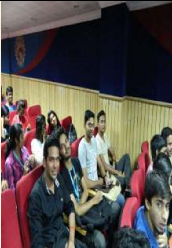
VII SEM STUDENTS PARTICIPATION IN THE EXPERT TALK