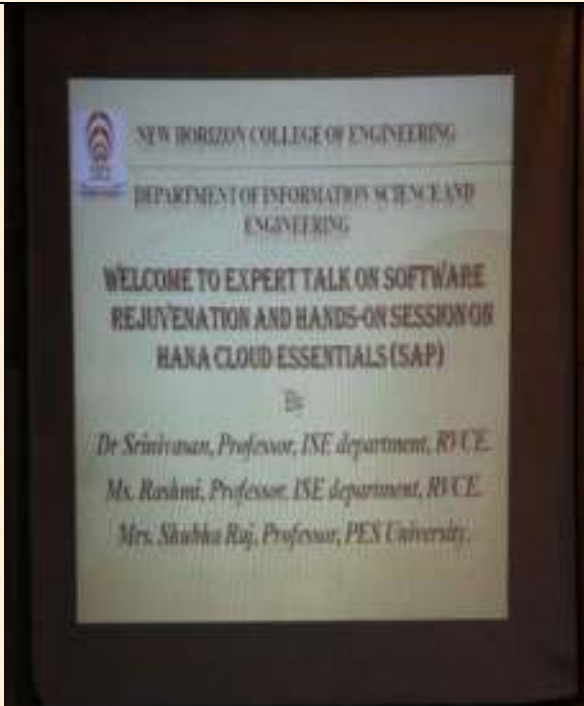
BANNER FOR THE EXPERT TALK & HANDS-ON SESSION