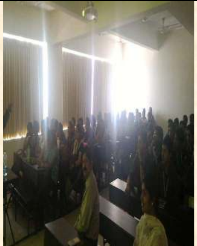
FACULTIES AND VII SEM STUDENTS LISTENING TO DR.JITENDRANATH MUNGARA, ISE HOD, TECHNICAL TALK ON IOT.